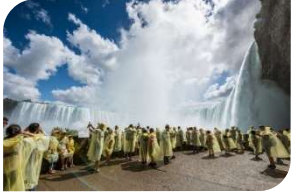
Journey Behind the Falls

The following options are for informational purposes only. These options are not coordinated or conducted by the Conference or Co-Host Committee.