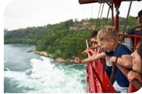
Whirlpool Aero Car