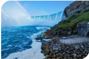
Niagara Parks Power Station