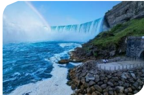
Niagara Parks Power Station