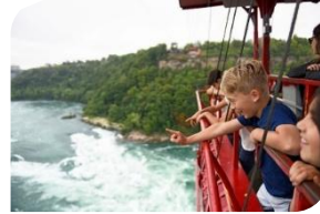
Whirlpool Aero Car