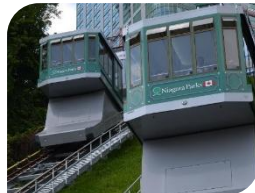
Falls Incline Railway