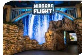
Niagara Takes Flight