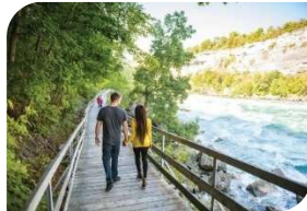
White Water Walk