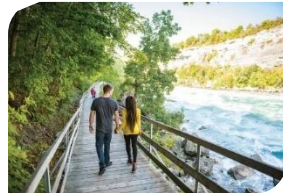
White Water Walk