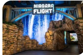
Niagara Takes Flight