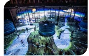
Niagara Parks Power Station