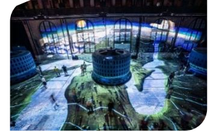
Niagara Parks Power Station