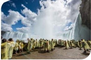
Journey Behind the Falls

The following options are for informational purposes only. These options are neither coordinated nor conducted by the Conference or the Co-Host Committee.