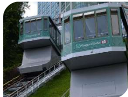
Falls Incline Railway